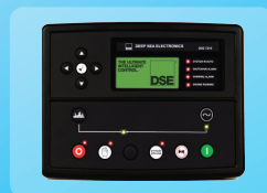
• Gen Controller