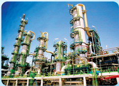
• Industrial & MFG