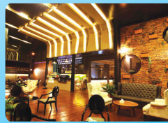
• Hotel & Resort