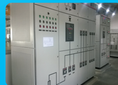
• Multi Gen Controller