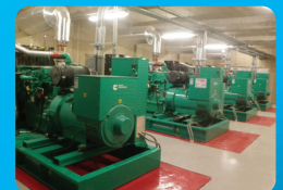
• Power Plant