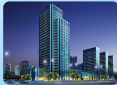
• Office Building