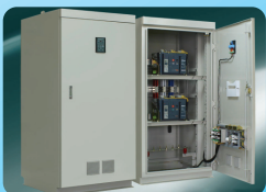
• ATS GRID-GEN