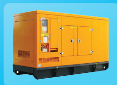
• Canopy Generator